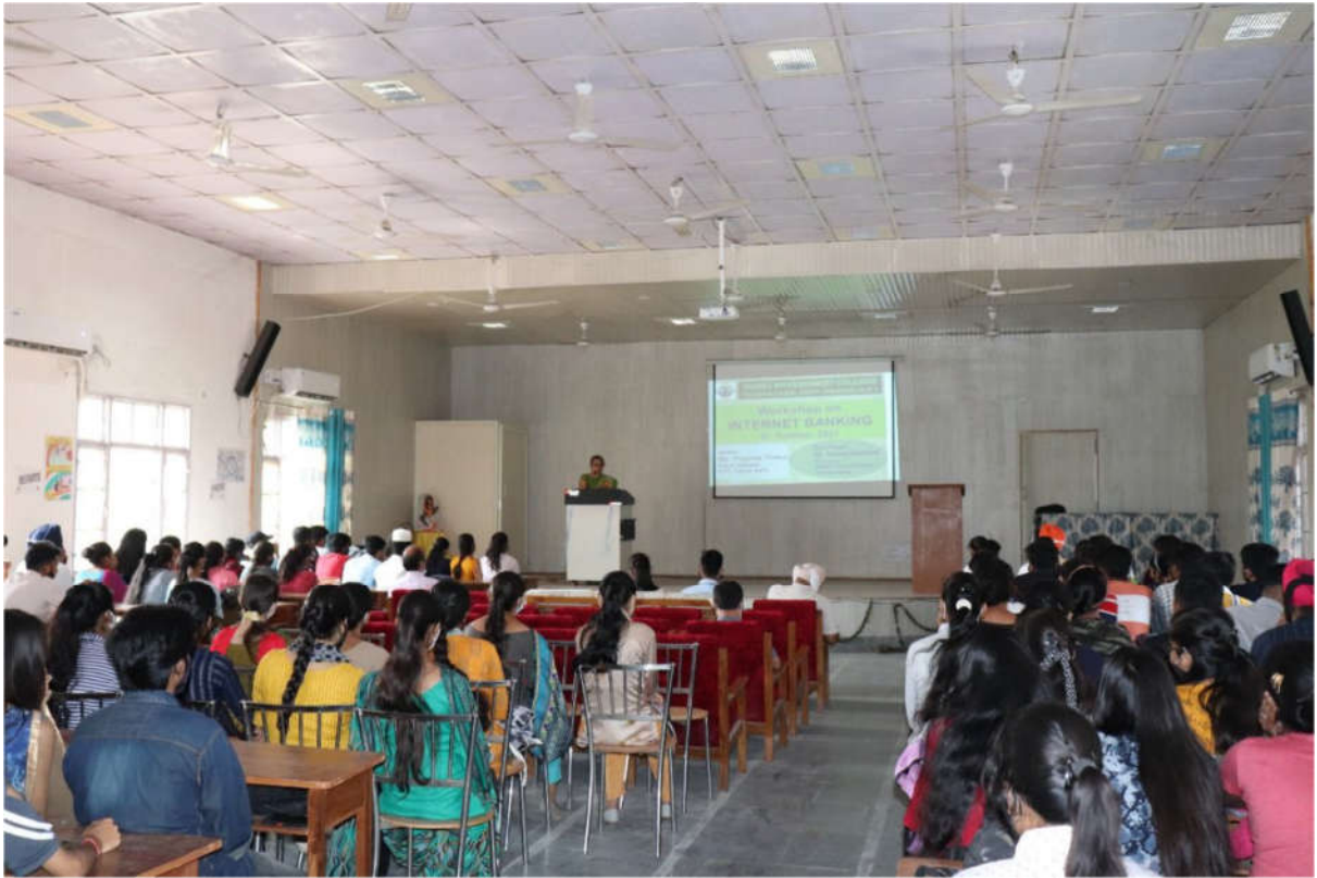
Photograph 30 Internet Banking